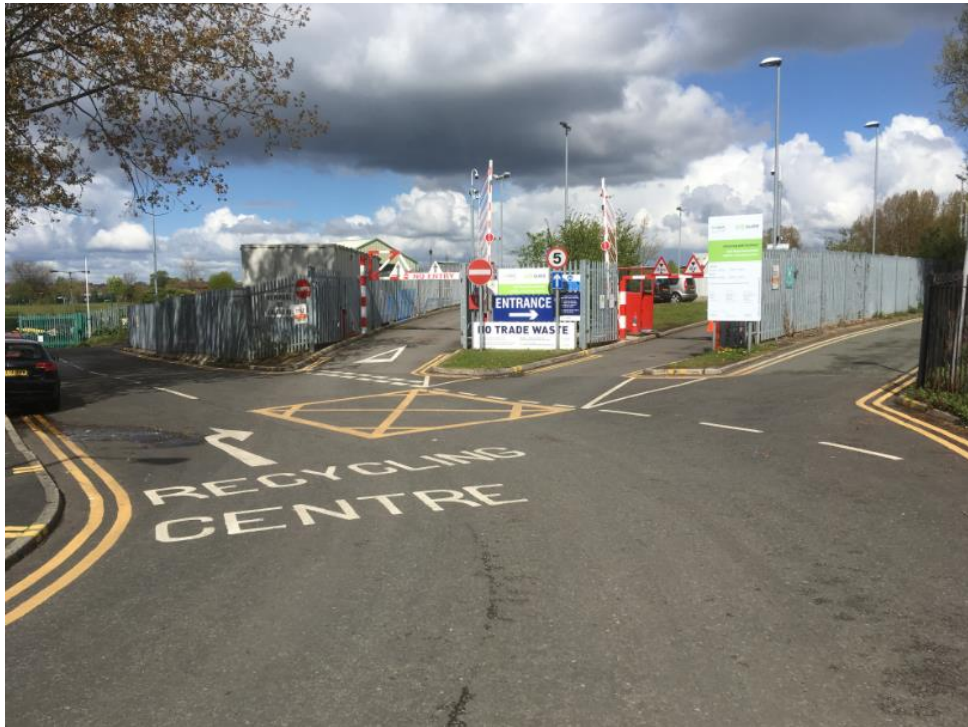
Photo 3: Direct view toward the entrance. Trees would be removed to accommodate access improvements.